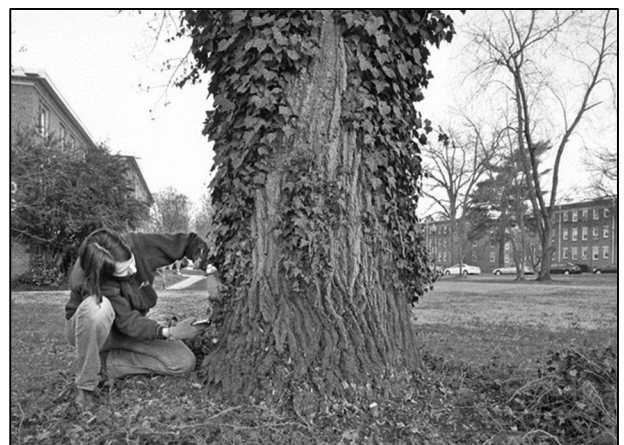
Ivy can be pretty, but is detrimental to the tree's long-term health

It's hard not to notice: ivy and vines growing on trees. Heavy vines cause damage and death to mature trees by loosening the bark and holding moisture against the trunk, making a good environment for fungal disease and decay. Heavy vines can take trees down in the wind, snow, and icy conditions. A good technique to get rid of ivy on trees is to: 1. wait until after a rainfall for soft soil, 2. use a hand pruner to cut ivy stems at their roots around the tree trunk, and then 3. get as deep as you can and pull the roots out! Leave the ivy already on the tree to die on its own, as pulling it off can damage the tree bark and cause problems for the tree's health.