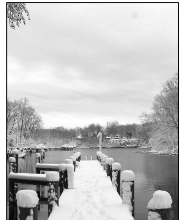
OLD MAN WINTER VISITS SYLVAN SHORES